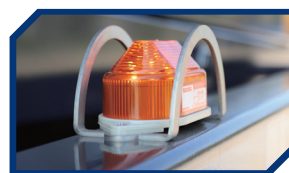
Acousto-optic Warning Lights