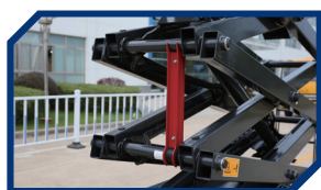
Safety Overhaul Bracket